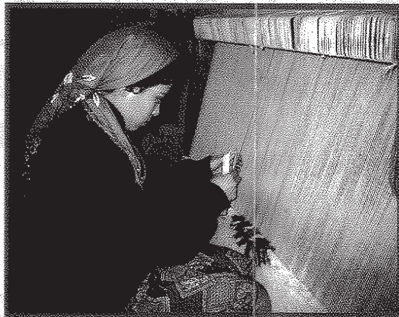
TURKISH WEAVER, VILLAGE LOOM

In the mid-19th century this applied to the highly unstable aniline dyes that were first used. In the early 1900's these dyes were outlawed in Persia with very stiff penalties, as they caused the colors to run. Today, chrome dyes