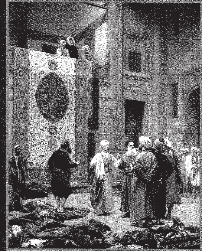
© The Minneapolis Institute of Arts, "Carpet Merchants", Artist, J.L. Gerome